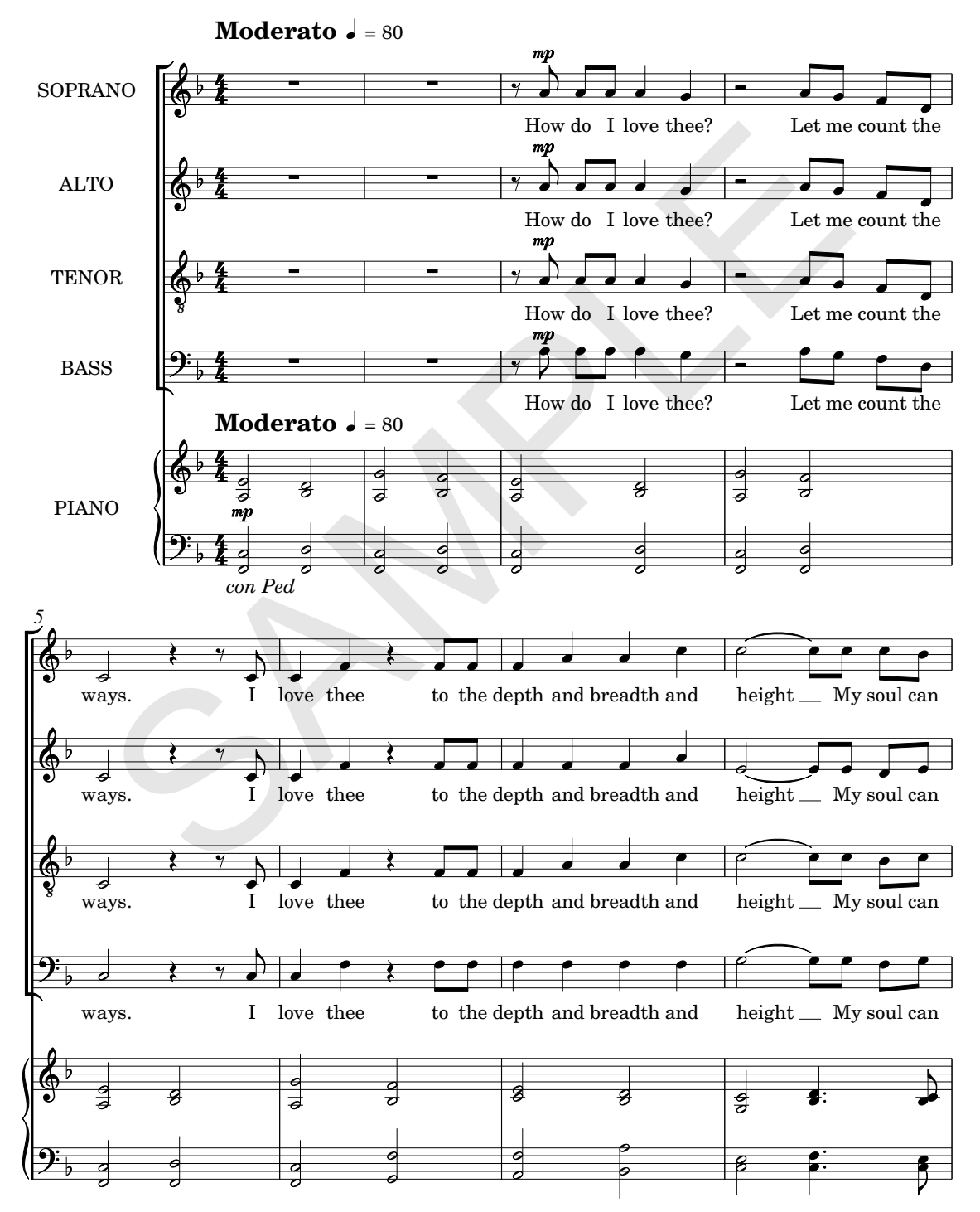
© Copyright Ward Swingle 1989. Published by Swingle Music. All rights reserved.