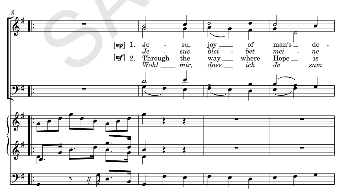
This edition © copyright 2008 by Boosey & Hawkes Music Publishers Ltd