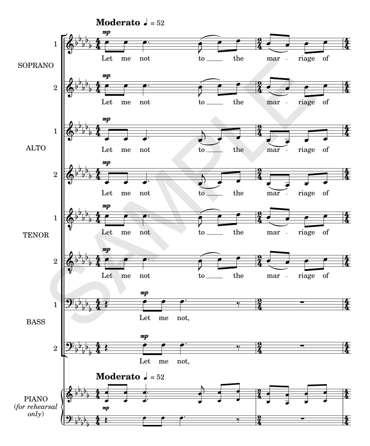
From Shakespeare Songs