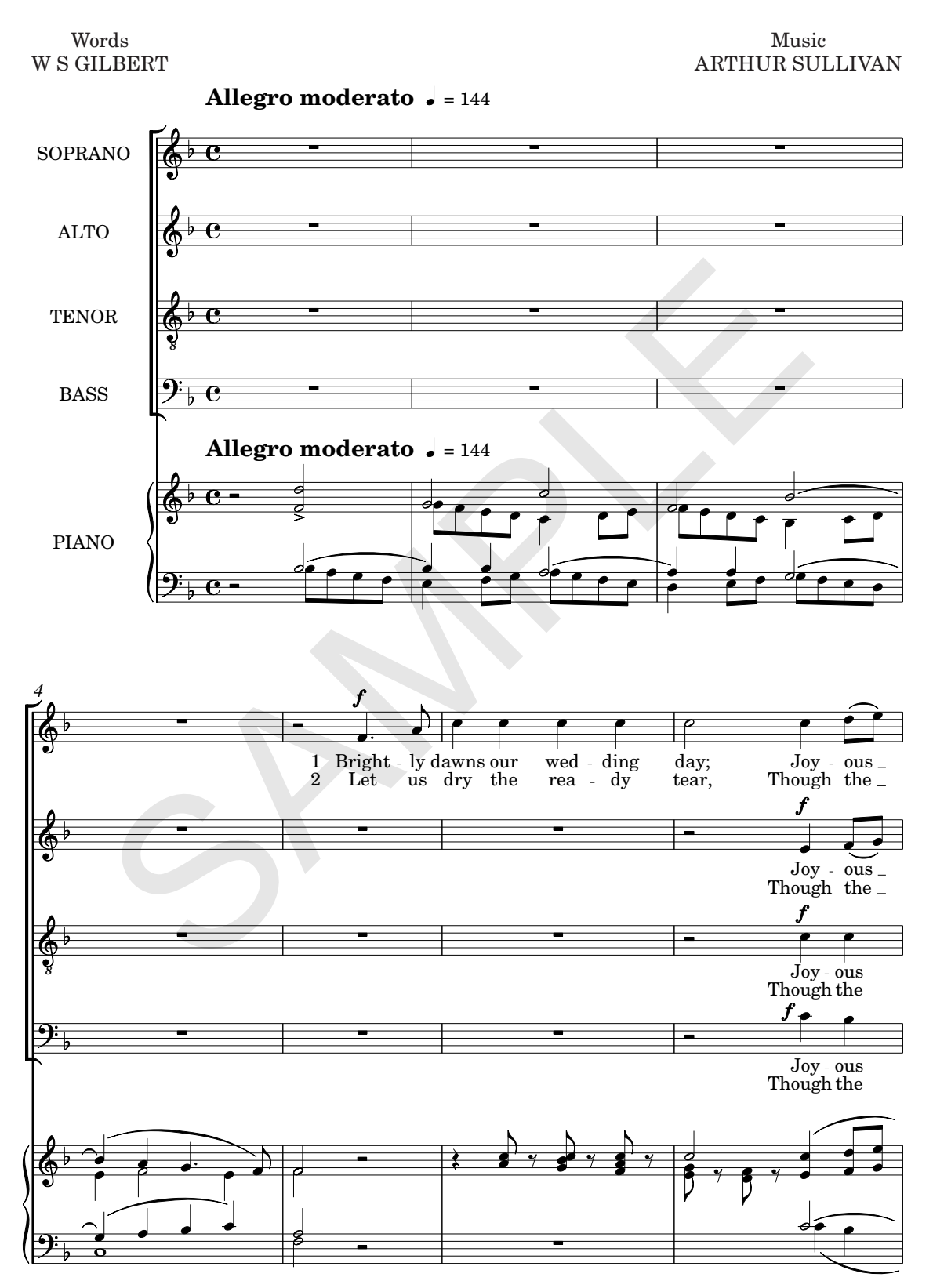
This edition © copyright 2008 by Boosey & Hawkes Music Publishers Ltd