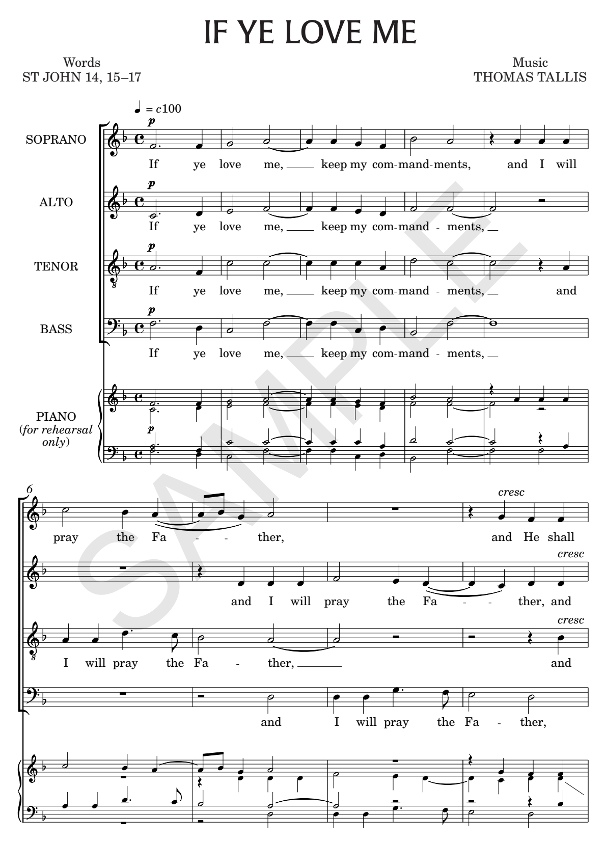
This edition © copyright 2008 by Boosey & Hawkes Music Publishers Ltd