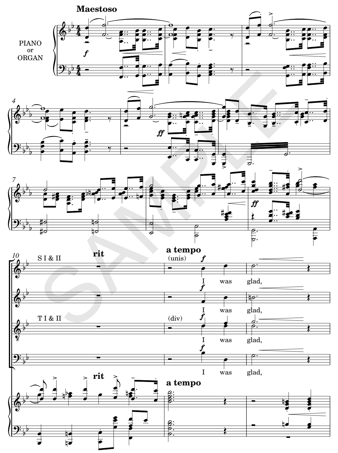
This edition © copyright 2008 by Boosey & Hawkes Music Publishers Ltd