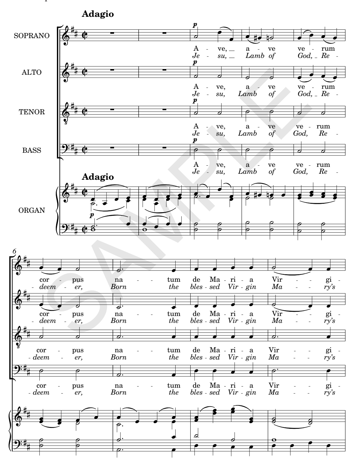
Words 14th-CENTURY HYMN, attrib Pope Innocent VI

This edition © copyright 2008 by Boosey & Hawkes Music Publishers Ltd