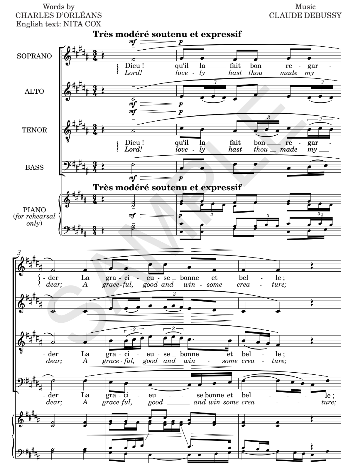
This edition © copyright 2008 by Boosey & Hawkes Music Publishers Ltd