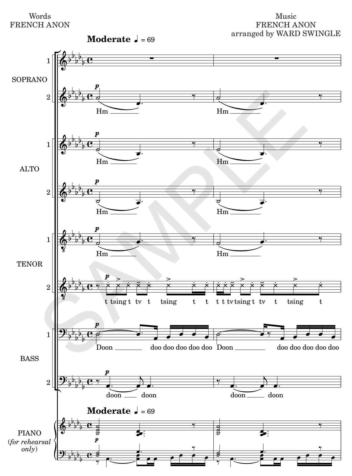
© Copyright Ward Swingle 1984. Published by Swingle Music. All rights reserved.